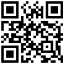
JOINT SECRETARY (EXAMS.)

NOTE: A candidate is declared 'PASS' in the examination if he / she obtains at one sitting a minimum of 40% marks in each paper and 50% marks in the aggregate of all papers.